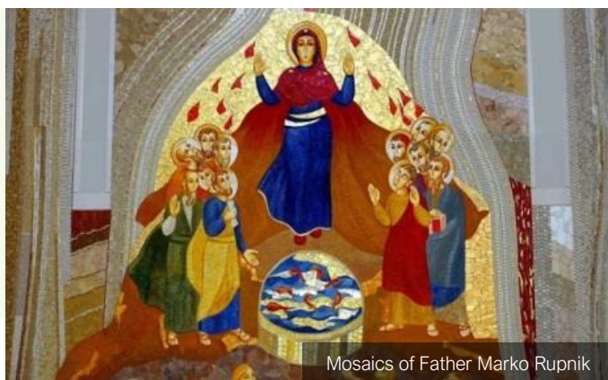
Mosaics of Father Marko Rupnik

The group Room for More from Ukraine, sings: "Оживи", meaning "Revive [us]!". Let us listen to their voices and join in their call: Click here .