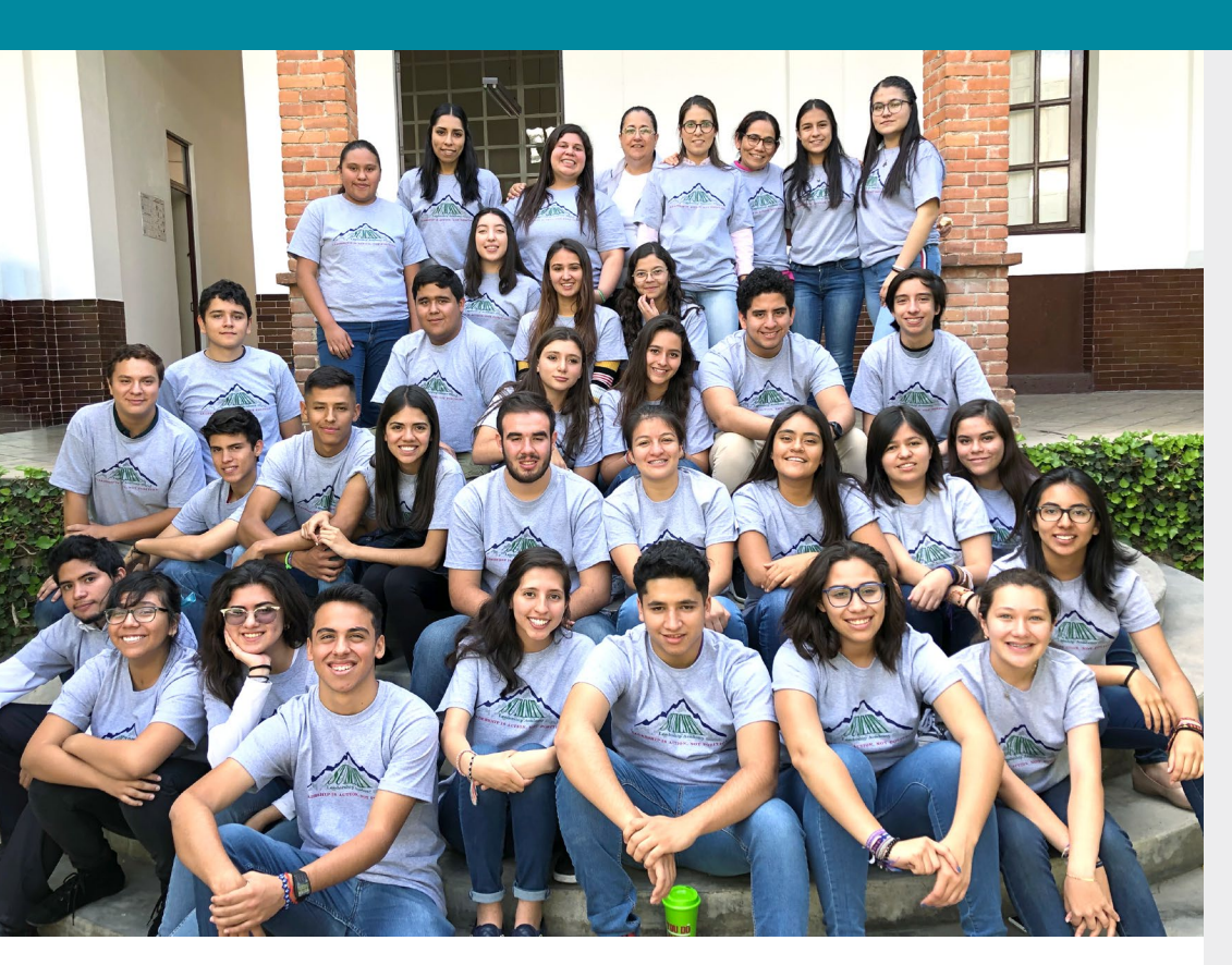
One of the youth initiatives at the Stuart Center, the Summit Leadership Academy (SLA) is designed to help young adults ages 18-30 rise to their heights as confident, competent leaders in the 21st century.