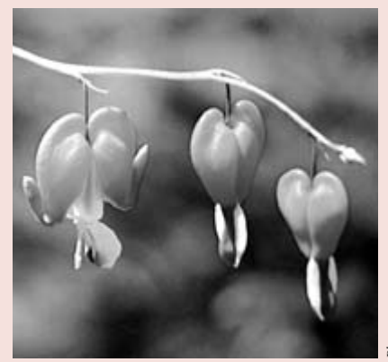
SPRING '04 • Vol. 2, No. 1

Correction: Mary Robinson resigned in 2002 as United Nations high commissioner of human rights. An article in the Winter 2003 issue of Heart said she currently holds that post.