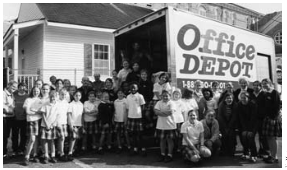
Students take a break from their work.

Frischhertz Electric Company in New Orleans donated a generator and spare parts. Office Depot provided school supplies at a discount and a truck for transporting supplies to the barge.