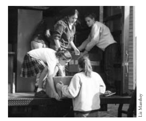
Sacred Heart students in New Orleans load supplies bound for Haiti on truck donated by Office Depot.

After a flurry of begging and buying, gathering and packing, the students loaded up a truck with three tons of goods: educational and art supplies, desks and easels, tents for use as temporary classrooms, mattresses,