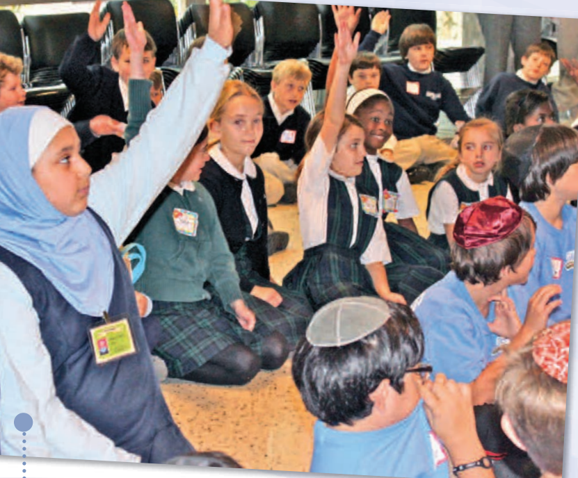
Sacred Heart Schools, Sheridan Road, fourth graders spend time with students from a Jewish school and a Muslim school while learning to express themselves creatively.